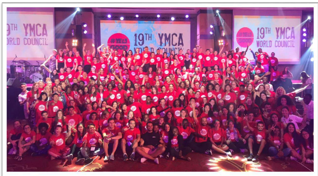
A fabulous finale of the Closing Ceremony