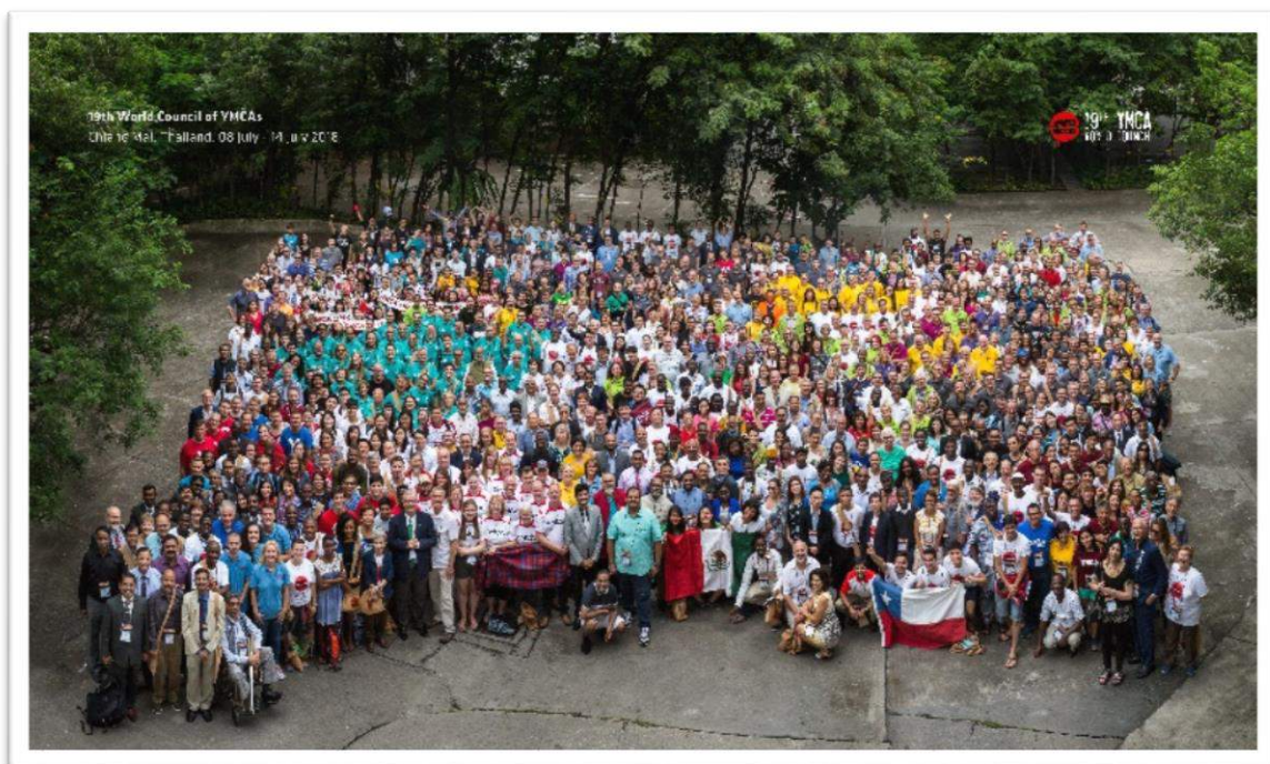
Over 1,300 people from nearly 90 countries celebrate making history at the 19th World Council