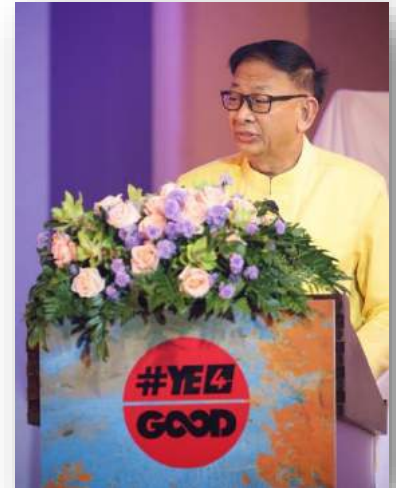
Welcome from the Deputy Governor of Chiang Mai

A beautiful Thai concert made for a memorable opening event.