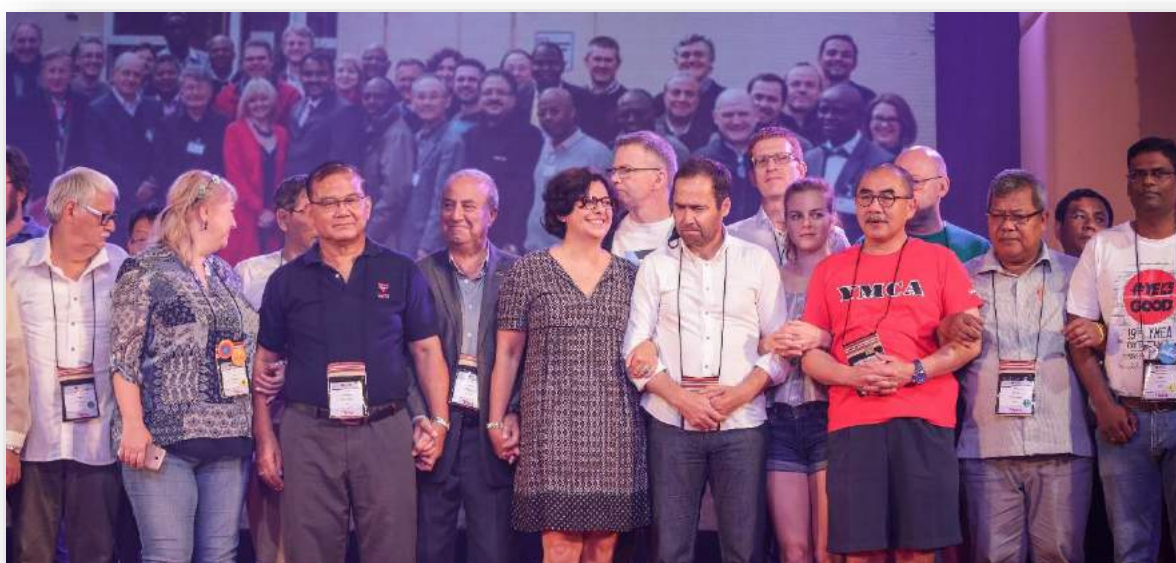
Standing together. Our NGS uniting on the long journey

In this presentation they spoke of their work towards becoming united under one shared message and working together as an NGS network. This involved the importance of relationships – having a safe space to nurture trust, sharing and learning – building foundations together and a strategic focus.